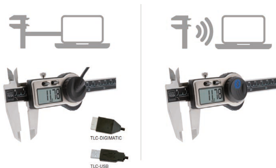
The TLC cap comes in two versions: with cable or wireless transmission

With the flexibility provided by the TLC (TESA Link Connector) connector, the issue of data transmission is no longer a source of stress during the initial purchase of the instrument. Indeed, by externalizing the technology related to data management into this accessory, TESA enables updating its instruments at any time, whether for cable-based or wireless management.